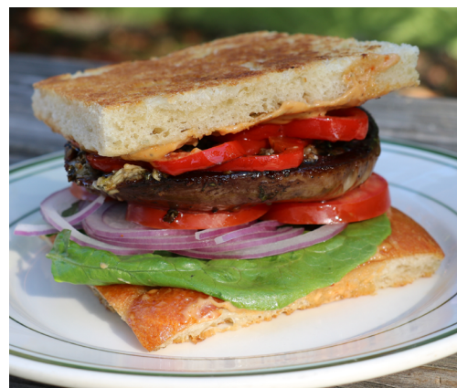
The Portabella Burger on Rosemary Focaccia.

Focaccia served on our Portabella Burger, or build-your-own on one of these amazing breads for a memorable sandwich experience.