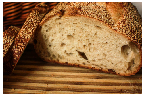
Sesame Semolina Sourdough.

We offer a broader selection of Rise Up! Artisan Bread for sale by the loaf in the bakery area of the store, including the newly added Sesame Semolina Sourdough.